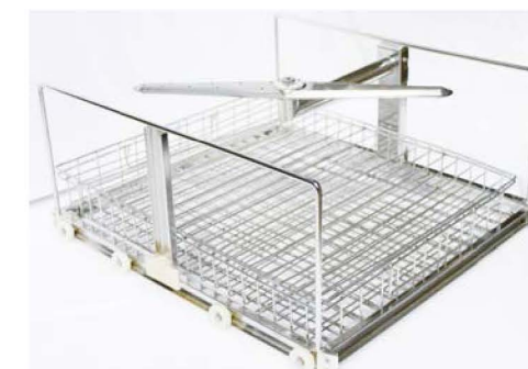
Petri dish rack