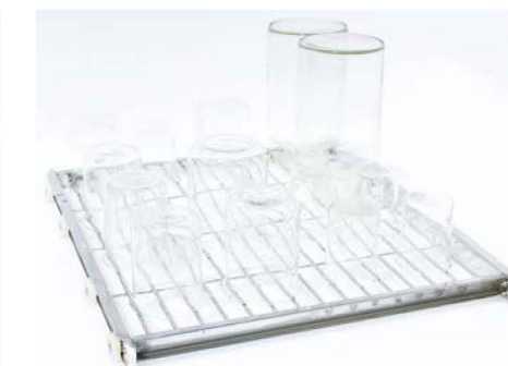
Wide-mouth bottle rack